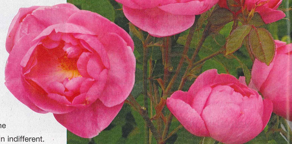
Rosa 'Ausimple' Skylark

To see even more new plants, visit www.gardeningclub.com and click on WebExtras.